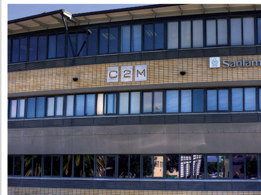
2nd Floor, Tygerforum B, Tijger Park, 53 Willie van Schoor Avenue, Tygervalley GPS Coordinates S33°52.43 / E018°38.08